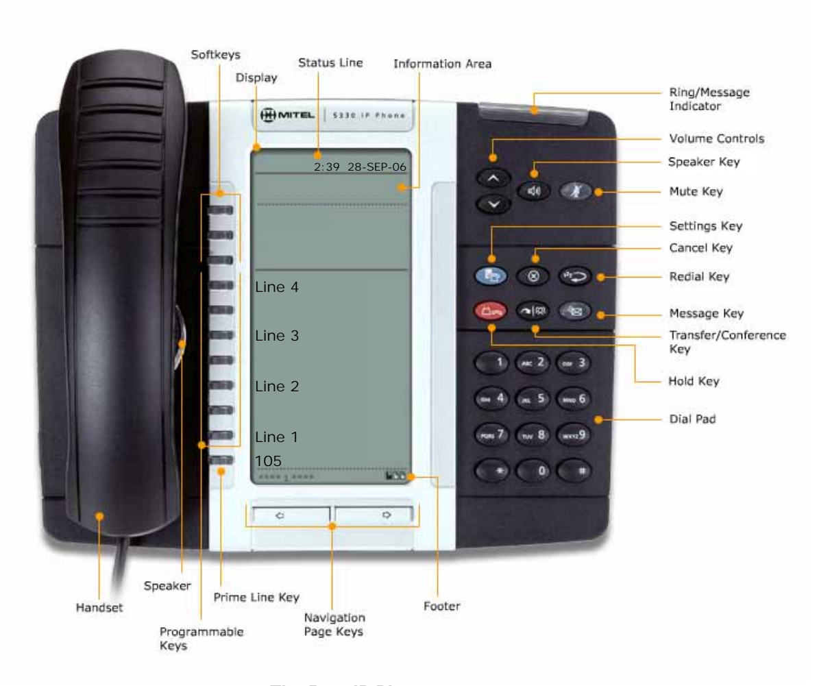
The 5330 IP Phone

The 5330 and 5340 IP Phones support Mitel Call Control (MiNet) protocol and session initiated protocols (SIP). Both phones support the 5310 IP Conference Unit. The 5330/5340 phones are ideal for executives and managers, and can be used as an ACD Agent or Supervisor Phone, as well as a Teleworker Phone.